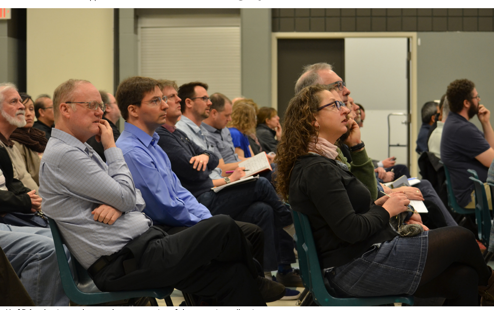
U of R Academic members at the presentation of the tentative collective agreement.

URFA has formed a member mobilization committee to continue with efforts to mobilize the entire URFA member outside of collective bargaining. If you would like to get involved, contact URFA at urfa@uregina.ca.