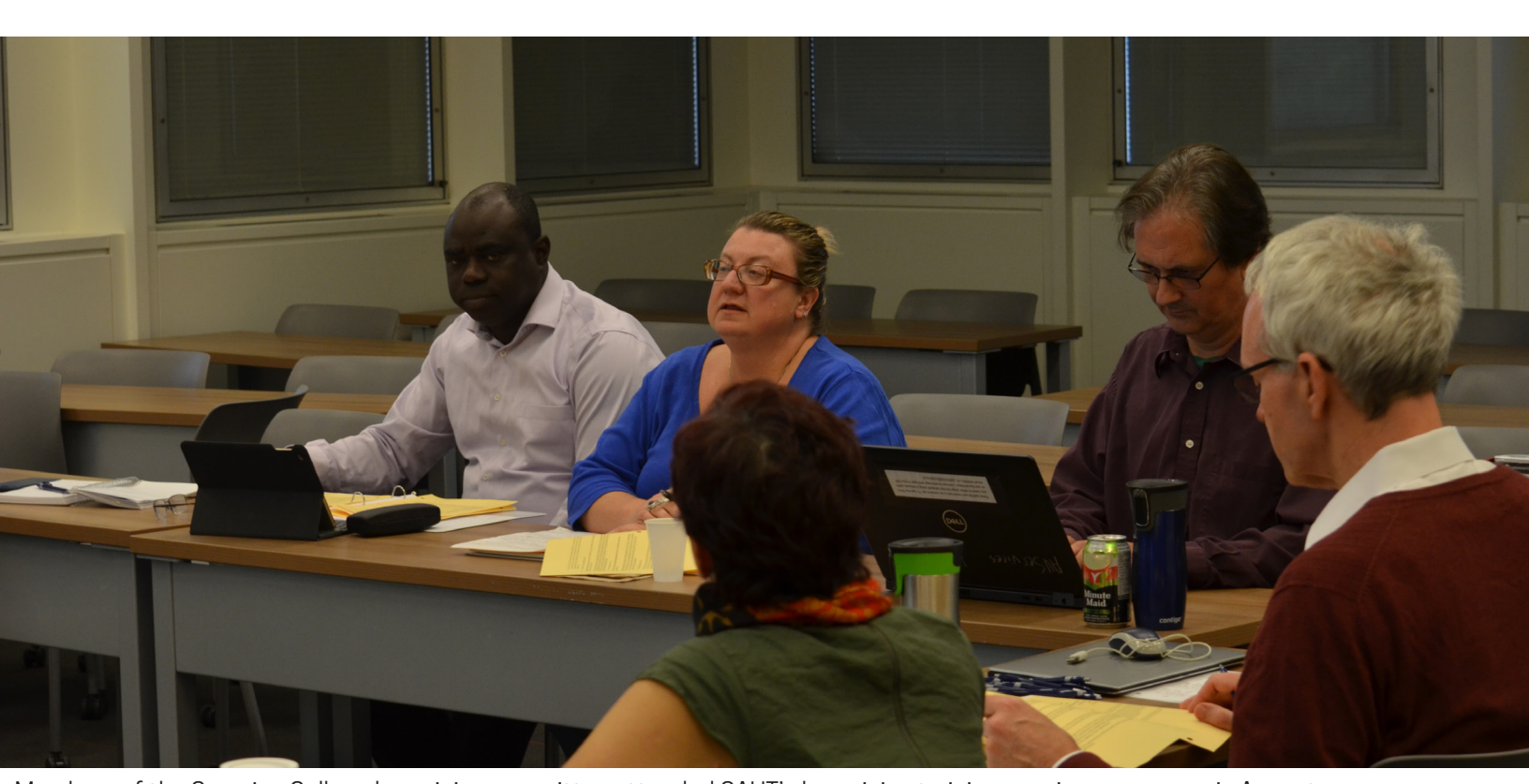
Members of the Campion College bargaining committee attended CAUT's bargaining training session on campus in August.

The FNUniv Sessional contract expires at the end of 2019. A Bargaining Committee has been formed, and a bargaining priorities survey was sent to members in the spring. Membership meetings will occur later in the year as the committee and URFA prepare for negotiations as early as this year.